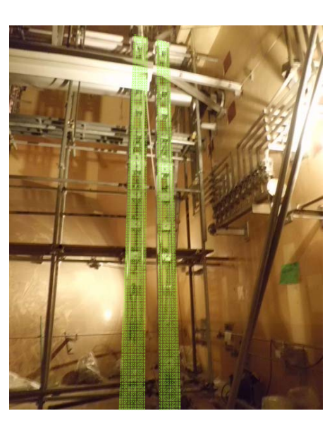
Steel support pillars (highlighted in color are pillars) *installed two pillars(among32)

Photos taken: at 14, June 7, 2011