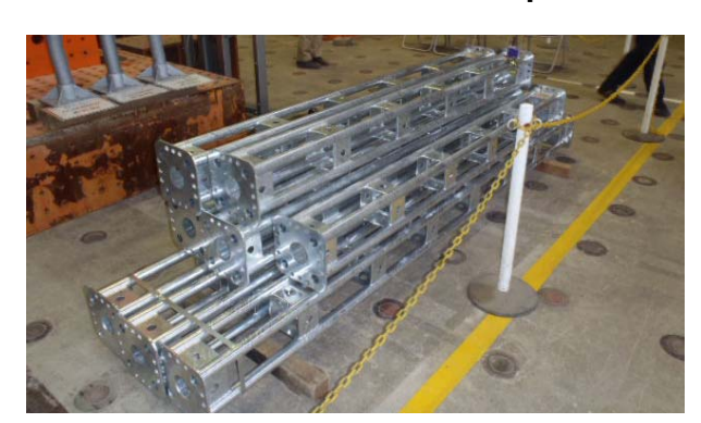
Steel support pillars