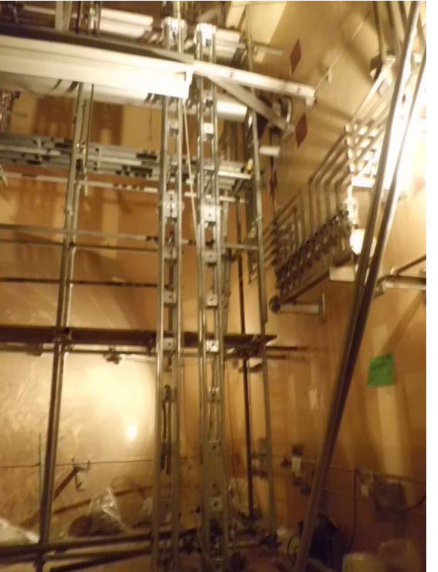
Installation of steel support pillars