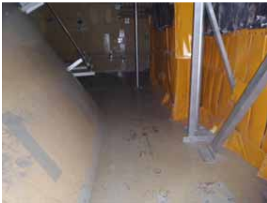
Before installation of steel support pillars (May 31)