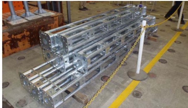
Steel support pillars