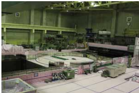
Before the concrete hatch removal (Photo taken on September 10, 2012)