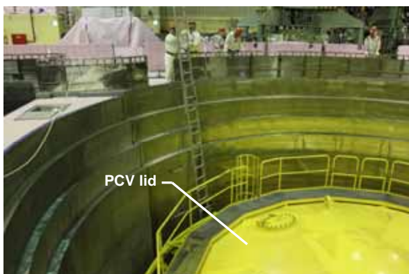
After the concrete hatch removal (Photo taken on September 10, 2012)