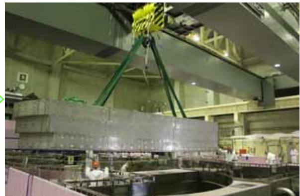
Concrete hatch removal (Photo taken on September 10, 2012)