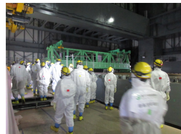
Inside Unit 4