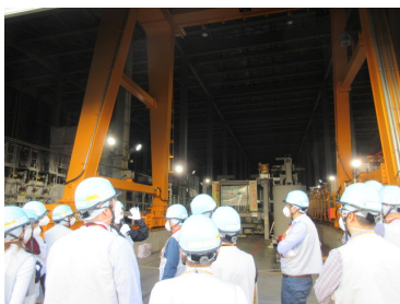
At the additionally installed ALPS