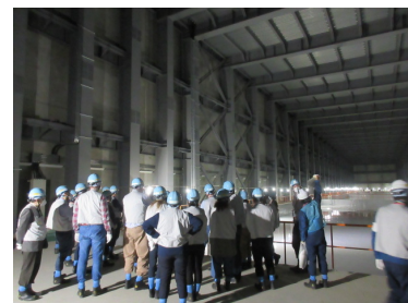
At the large waste storage facility