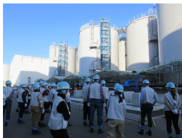
At the K4 tank area